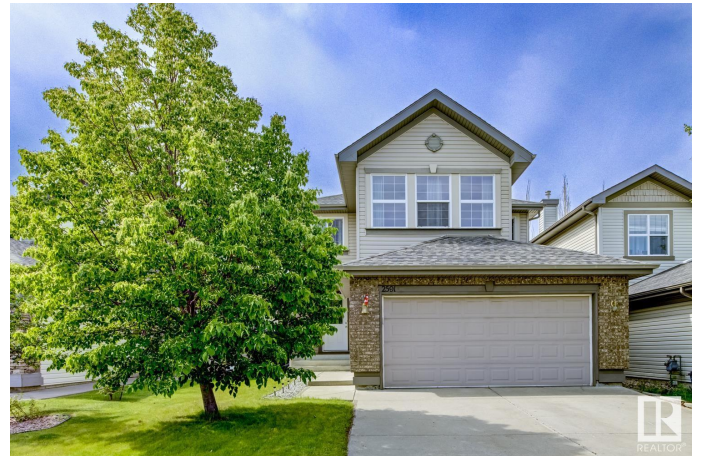
2591 Hanna Crescent NW