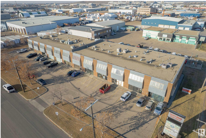
15612 116 Ave NW, Edmonton, AB

Main Floor Exterior Area 1885.08 sq ft Interior Area 1569.02 sq ft